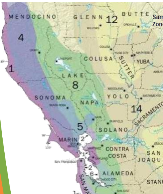
Monthly Average Reference Evapotranspiration by ET 0 Zone (inches/month)