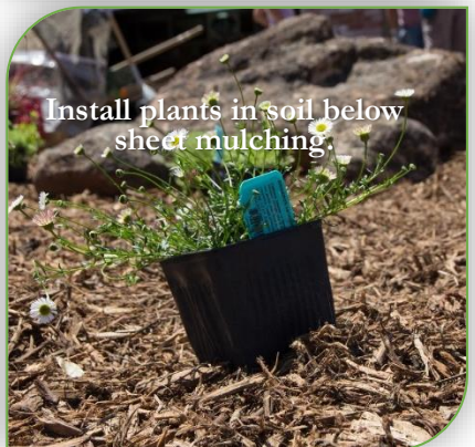
Install plants in soil below sheet mulching.