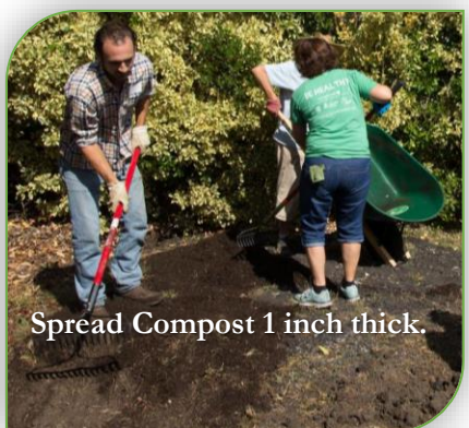
Spread Compost 1 inch thick.