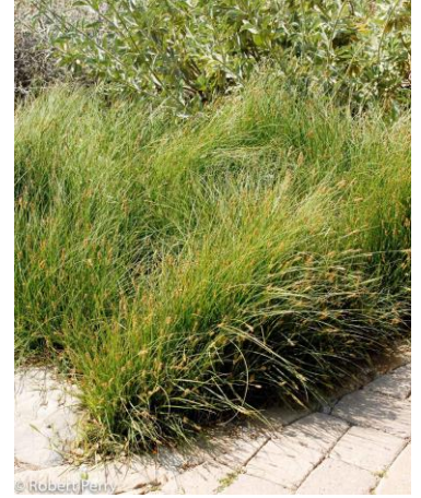
CA Field Sedge