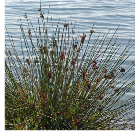
Ca Gray Rush